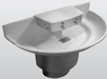
Half Round Washfountains