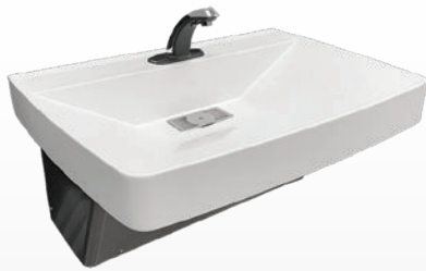
Contemporary Lavatories 2