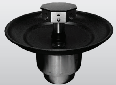
Full Round Washfountains