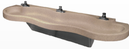
Lavatory Systems 2