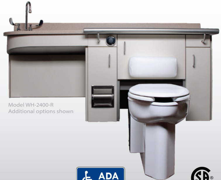
Model WH-2400-R Additional options shown

The highly durable 2400 Series unit is the only bedside unit in the market with 42 inches of unobstructed access to the water closet.