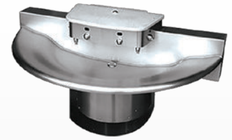
54” Half Round Washfountain