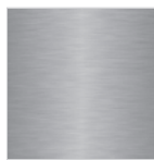
TYPE 316 (MARINE-GRADE)