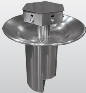
36” Full Round Washfountain