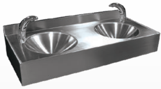
Lavatory Deck – Straight Front