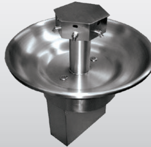
42” Full Round Washfountain