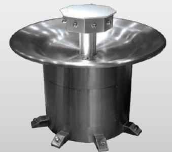
54” Full Round Washfountain