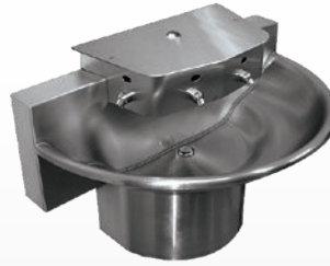
42” Half Round Washfountain