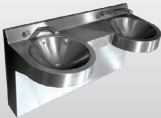
Lavatory Deck – Round Front