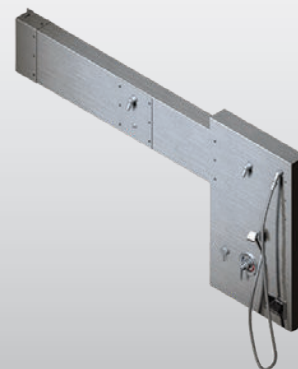
Continuous Wall Showers