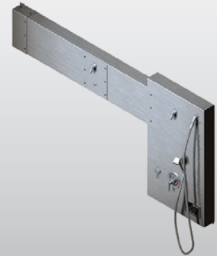
Continuous Wall Showers