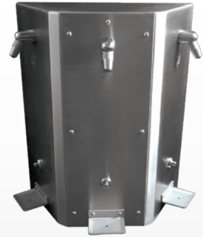
Three Station Wall Showers