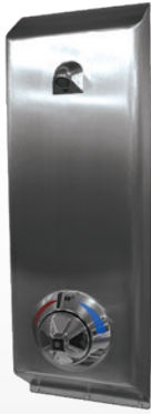
Single Station Wall Showers